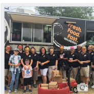
Nassau County School Nutrition Association, Inc @nassawnutrition

September - Avocado February - Celery October - Satsuma March - Cauliflower November - Yellow Squash April - Blueberry December - Snap Bean May - Watermelon January - Radish