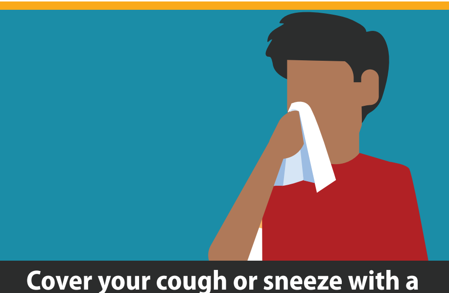
Cover your cough or sneeze with a tissue, then throw the tissue in the trash and wash your hands.

Stay at least 6 feet (about 2 arms' length) from other people.