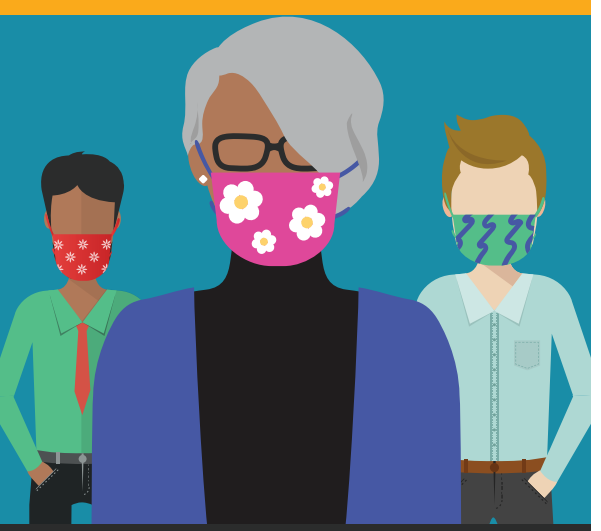
When in public, wear a cloth face covering over your nose and mouth.