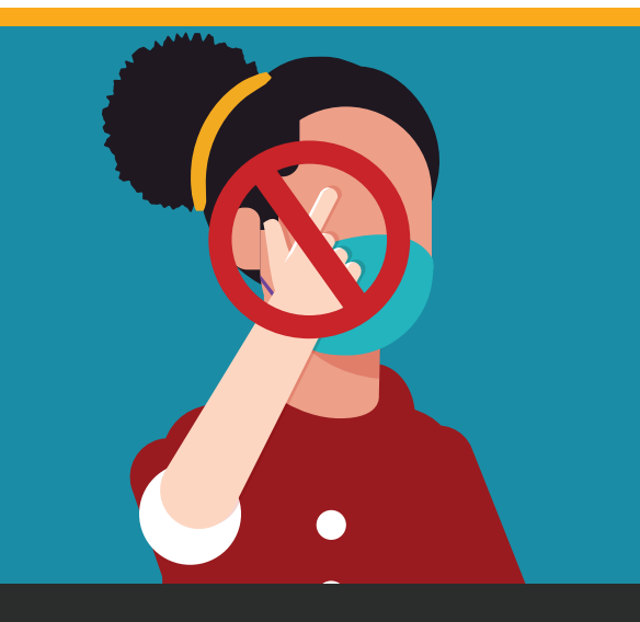
Do not touch your eyes, nose, and mouth.