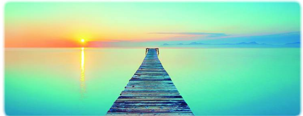
Some provisions above may not be available under your employer's plan and/or your investment contract.

Yes, a distribution from a traditional 403(b) or 457(b) account is generally taxed as ordinary income in the year it is issued. There are specific federal tax-withholding rules that apply to all distributions from retirement savings and investment plans. The taxes on plan distributions can be complex. For these reasons, if you are considering a distribution from your account, you are encouraged to seek professional tax advice. If you choose to take a distribution, you are responsible for satisfying the distribution rules and for any tax consequences. Distributions to participants are reported annually by the provider on IRS Form 1099R.